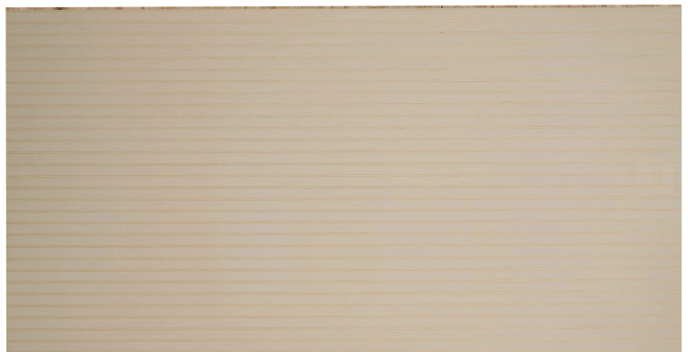
1.6" V-Bead pattern on the reverse side, primed and ready to use